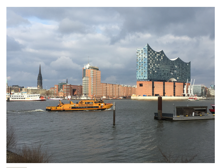
FIG. 1 The Elbhilharmonie

architectural mundanity of MediaCityPort. From 2002 to 2003, they lobbied for the idea of an iconic concert hall placed on top of the Kaispeicher and designed by the two newly crowned star architects. In 2003, they introduced Herzog & de Meuron's visualization to the media, launching what later would be called the Elbphilharmonie to the public. This proposal, henceforth, garnered media and civic support. The German weekly news magazine Stern <sup>17</sup> reported favorably on the proposal in June 2003. The first big article appeared locally in the Hamburger Morgenpost in August 2003. A few months later, the Hamburg Senate abandoned the MediaCityPort project and eventually in October 2005, the Hamburg State Parliament consensually approved building the Elbphilharmonie on the basis of a feasibility study and authorized the Hamburg Senate to award the project.