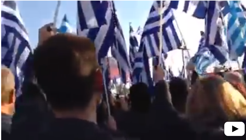
FIG. 10 Still from “Όχι Τζαμί Στην Αθήνα: Εθνικός Ύμνος - Ύμνος Χρυσής Αυγής [No to the Mosque of Athens: National Anthem and Golden Dawn Anthem],” 0:28. https://youtu.be/F3kMxVVX1II

an immigrant or a refugee feels unwanted in public space and urged to live a more restricted and private life. A series of different realities emerge here: the reality of the immigrant who is targeted by Golden Dawn; the reality of the refugee, whose presence is opposed not only by transnational and national policies but by the locals themselves; the reality of the Golden Dawn supporter who is made to see the “other” in the city as a threat. To these, many more realities could be added: the reality of the state that has become radically impoverished as a provider of social services and securities; the reality of a city that has become a testing ground—for Europe and perhaps for the rest of the world—for discipline, austerity, and tighter surveillance measures; but also the reality of the emergence of new kinds of citizen-led initiatives and civil actions in the city to fill in the voids of a state that has become radically impoverished as a provider of services and securities. Clearly these realities cannot be easily bridged and brought together into a single, common world. This condition makes Stengers’ “Cosmopolitical Proposal” 40 highly significant here.