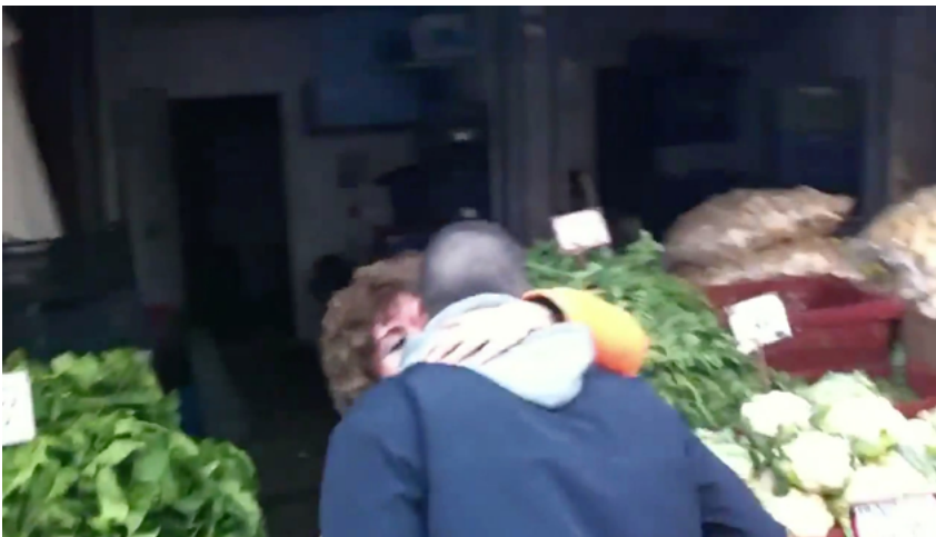
FIG. 9 Still from "Παναγιώταρος Κασσιδιάρης Στην Βαρβάκειο Αγορά [Panagiotaros Kassidiaris at Varvakeios Market]," 2:32.

"other" in the city 39 . As mentioned above, Agios Panteleimon, Attiki Square, Varvakeios Square, and Eleonas are all neighbourhoods of downtown Athens which have been dramatically downgraded in the context of the crisis. They are also places of the highest immigrant population in the city (Agios Panteleimon and Attiki as residential areas and Varvakeios and Eleonas as workplaces) and this is one of the reasons why they have become major fields of operation by Golden Dawn. Their public space is highly active because of the presence of immigrants who work or live there: children of all backgrounds play in the playgrounds, ethnic shops saturate street life, and local businesses flourish in a place that would otherwise be empty due to the financial crisis. Such activities are however nowhere to be seen in the videos, revealing the people's rejection by those who have been there before them. These videos, apart from placing us in the position of those who turn to Golden Dawn, also reveal the situation of those who are absent from them. On the other side of each one of these filmed perspectives,