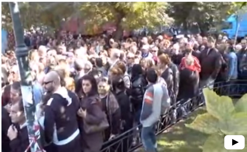
FIG. 6 "ΧΡΥΣΗ ΑΥΓΗ - Διανομή Τροφίμων στην πλατεία Αττικής" [Golden Dawn Dissemination of food in Attica Square], 0:39. https://youtu.be/_9EKa-nErMg