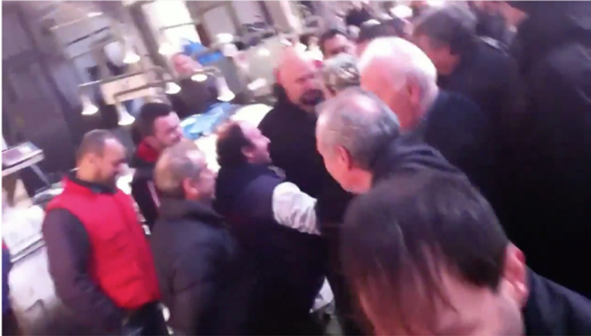
FIG. 8 Still from "Παναγιώταρος Κασσιδιάρης Στην Βαρβάκειο Αγορά [Panagiotaros Kassidiaris at Varvakeios Market]," 0:40.