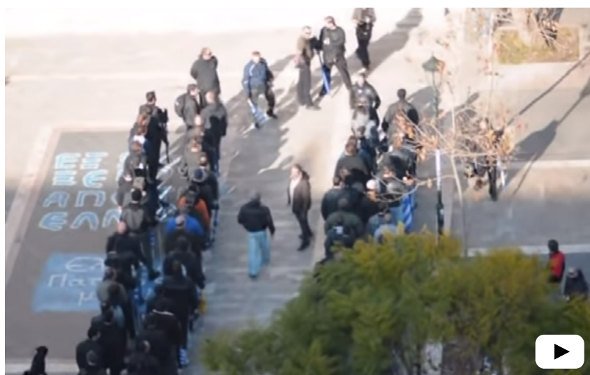
FIG. 2 “Η Μάχη Του Αγίου Παντελεήμονα - 15/1/2011 [the Battle of Agios Panteleimon - 15/1/2011], 3:14. https://youtu.be/UMmGzwP4ITl

who accuse the migrants for the degradation of the area (2:57). The video is cut abruptly and on the next scene Golden Dawn members are shown to line up in a military deployment across and ready to confront the Riot Police on the other side, with Michaloliakos commanding them [Fig. 2-3]. The residents stand behind them, as if they are to be protected by them. On the surface of the square, a large-scale inscription in blue reads: “foreigners (stay) out of Greece,” “Greece motherland,” and “Hellas” [Fig. 2, 3:14]. Within the indistinct noise, only the slogans can be clearly heard: “blood, honour, Golden Dawn” (3:14). Next, we see them fighting with the anti-fascists and the police, using bats and throwing objects (4:48). There is smoke from the tear gas and small fires on the ground [Fig. 4, 9:54]. The residents stay around the square, and once things calm down they return on it, holding and waving their Greek flags and singing the national anthem. The video puts us in the position of the vulnerable and defenceless residents who appear to have lost control of their public spaces. They might be watching from the balconies or from the street, with the sentiment that the official state has abandoned them in the midst of the financial crisis and within an increasingly deteriorating urban context. The Golden Dawn, it seems, is there to protect them.