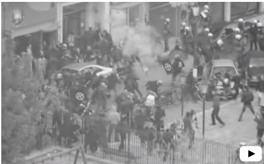
FIG.4 "Η Μάχη Του Αγίου Παντελεήμονα - 15/1/2011 [the Battle of Agios Panteleimon - 15/1/2011], 9:54. https://youtu.be/UMmGzwP4ITl

social position of the subject; their race, gender, class, etc. 24 Situatedness becomes key in grounding perception. Positioning takes here a double role. On the one hand, it has to do with learning how to see from another's point of view. Haraway points out that this "other" could even be our own machines, emphasizing on the social, technical, and psychical complexity of our visual systems. Such perspectives that cannot be known in advance open up space for the imaginary and the visionary, against any established and fixed perception. On the other hand, positioning has to do with the place of the observer in relation to the situation observed, and here lies the danger to romanticise and to take advantage of the vision from below: "the positionings of the subjugated are not exempt from critical reexamination, decoding, deconstruction, and interpretation; that is, from both semiological and hermeneutic modes of critical inquiry." 25 The viewpoint of the