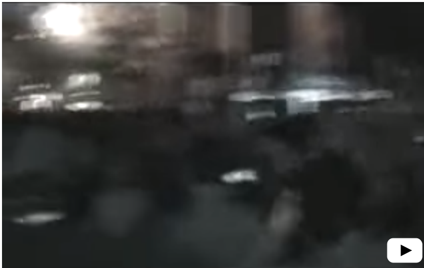
FIG. 1 “Η Είσοδος Της Χρυσής Αυγής Στον Άγιο Παντελεήμονα [the Entrance of Golden Dawn in Agios Panteleimon],” 0:21. https://youtu.be/lG0yhtelPeA

The video presents the appalling march of a mob of Golden Dawn members and supporters through the streets of Agios Panteleimon and is filmed by someone who is taking part in it. The viewer cannot focus on anything apart from the density of the crowd, and the excess of Greek flags waved by the people. Slogans are chanted loudly and rhythmically: “foreigners (stay) out of Greece” (0:02), “Hellas, Hellas, protect us too” (0:38), “Greece belongs to the Greek nationals” (0:59), along with the Greek national anthem, inspiring fear and intimidation. It is not clear from the video whether the participants are members of the party or mere supporters or even random residents that welcome the Golden Dawn to “reclaim” the area from its migrant inhabitants, but this is, perhaps, the point: the protagonist here is the viewer, who becomes an active part of the crowd to protest, to terrify, to reclaim [Fig. 1]. The viewer is invited to perform their own rage 22 by taking the place any of those shown in the video; they could have been a passer-by, a resident, a supporter