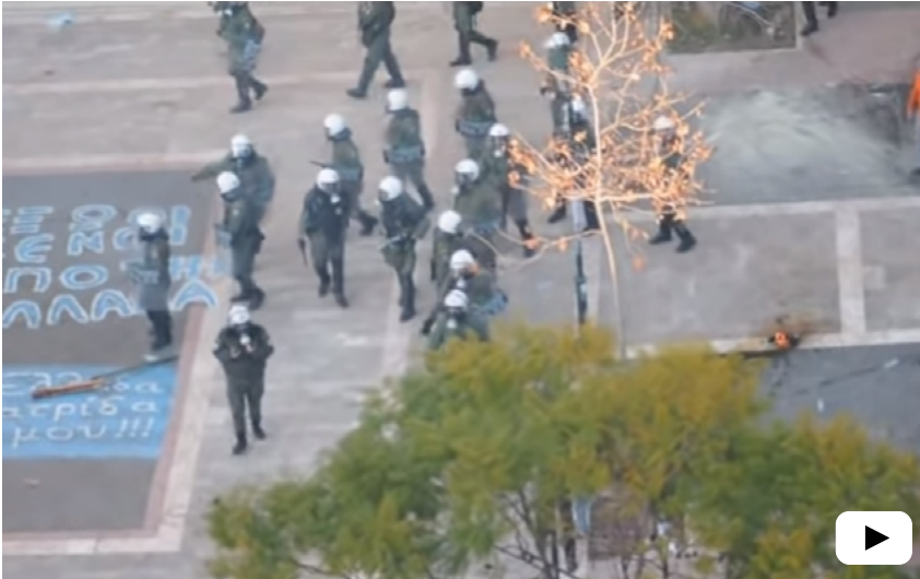
FIG. 3 "Η Μάχη Του Αγίου Παντελεήμονα - 15/1/2011 [the Battle of Agios Panteleimon - 15/1/2011], 7:58. https://youtu.be/UMmGzwP4ITl