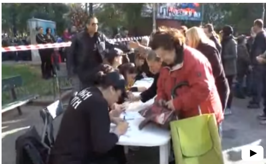
FIG. 7 "ΧΡΥΣΗ ΑΥΓΗ - Διανομή Τροφίμων στην πλατεία Αττικής" [Golden Dawn - Distribution of food in Attica Square], 0:50. https://youtu.be/_9EKa-nErMg

The protesters sing the national anthem followed by the Golden Dawn anthem. Then the speaker calls the audience to shout with him: "Long Live Nationalism!" "Long Live our leader!," "Long Live Golden Dawn!" (1:58-2:00)