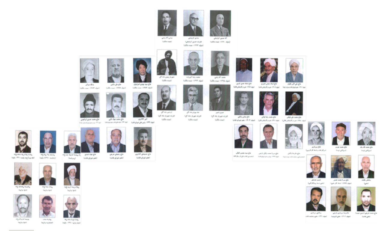
Major stakeholders of the Zarch ganat from 1960

Before the agricultural revolution and land reform of the 1960s, these organizations protected the water rights and supervised the distribution of water, and set the rules for the maintenance of qanats inside each qanat community. In most of the rural areas, every farmer could irrigate his land as much as his water share permitted him to do. The water share could range from few hours up to some months, according to the contribution and the share sizes of water users in qanats. Qanat shares were regularly allocated on the basis on the financial capability of their owners. Everyone could buy qanat's water shares even if he or she did not live inside the qanat region and had any land property in the village. However, the shareholding of many qanats were based on more complicated systems, based on a schedule rotating within a certain period. This water division system was consistent with all the likely fluctuation in the volume of water during the year, while quenching the farmers' demand for water.<sup>29</sup>