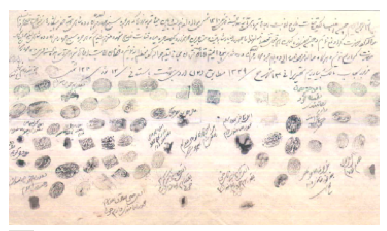
A document which shows the accordance of the shareholders of Zarch's qanat for general maintenance activities of Zarch's qanat in 1924.

done often voluntary but in the case of emergency: it was the duty of each healthy male water user to work for their qanats. Every user should have protected the qanat and its domain ( harim ) from pollution and any source of poisoning. Harim is usually constituted by a boundary of about 1.2 km in proximity of shafts in the hard soil areas and about 0.5 km in soft soil. The right/duty of domain protection gave the qanat's water users the possibility to reach the surrounding areas around the shafts in case of any required maintenance and shelter the qanats from any activities alongside the wells that could affect the purity of the waters or the functionality of qanats. [Fig. 4]