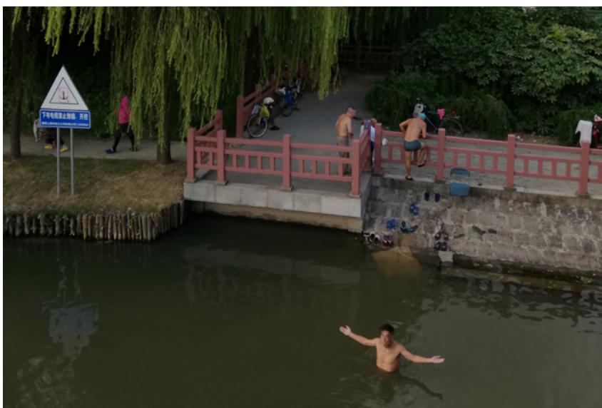
FIG. 21 Spontaneous use of watersides in new towns near Shanghai.