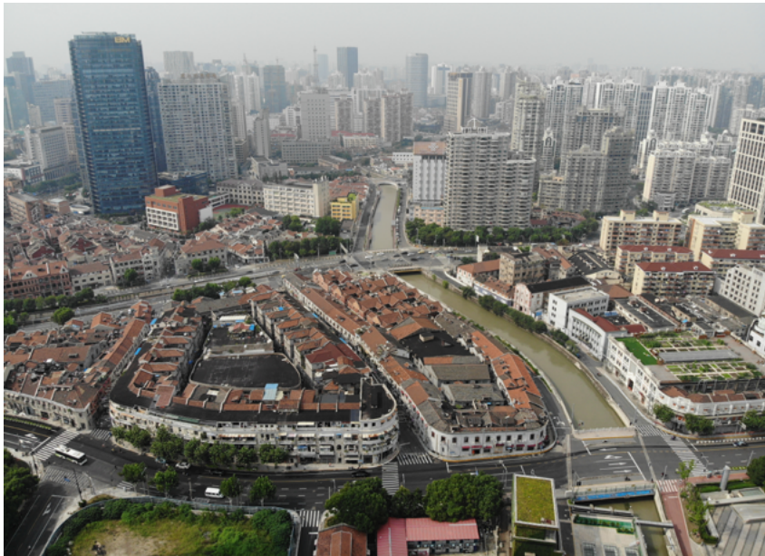
FIG. 4 Most creeks disappeared and the few remaining ones, such as Hongkou Creek, are often disconnected from urban life by floodwalls (photo by author, 2018).