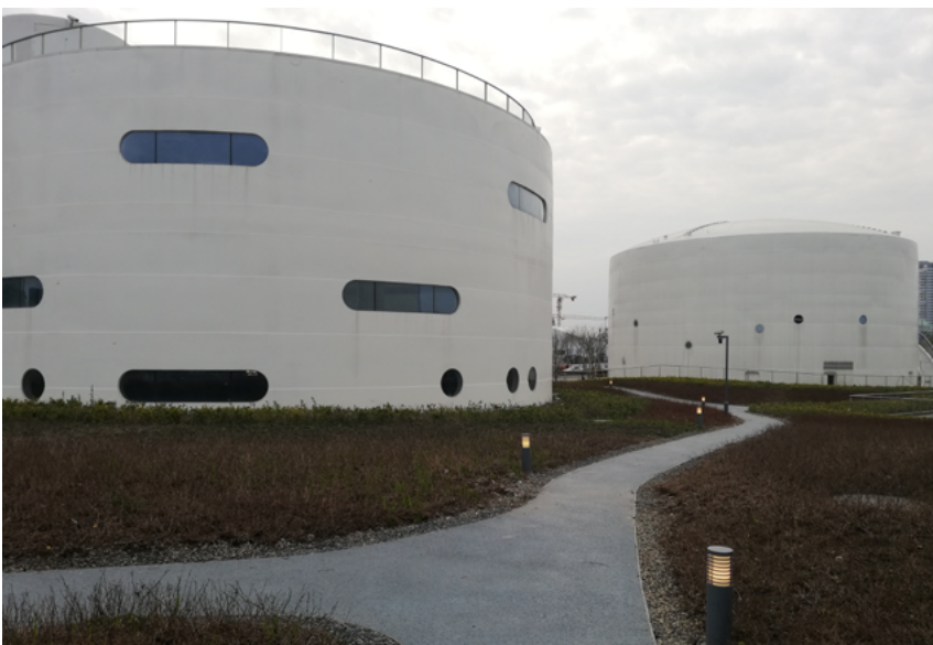
FIG. 9 Multiple new cultural institutions opened their doors in reused industrial relics. Here Tank Space, a center for contemporary art installations and performances (photo by author, 2019).