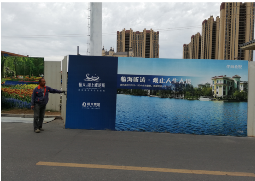
FIG. 17 Billboard of New Venice in Nantong (photo by author, 2018).