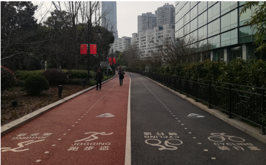
FIG. 8 Today there is more than 45 kilometer of combined cycling and pedestrian routes along the Huangpu's new waterfront.