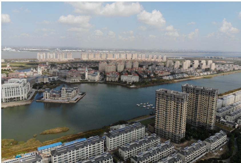
FIG. 14 Empty real estate for investment on Long Island. According to real estate agents and spoken residents almost 100% of the units are owned by Shanghainese (photo by author, 2019).