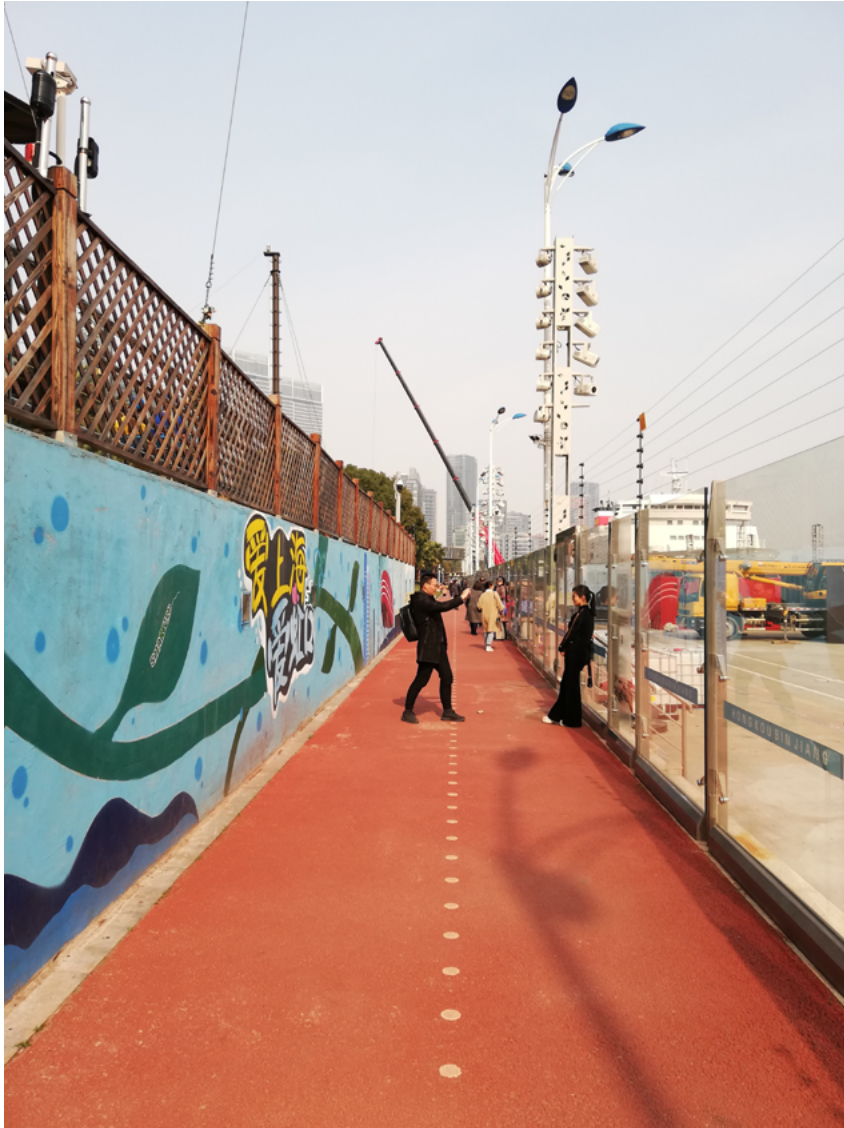
FIG. 10 Figure shows a partly privatized part used for docking small cruise ships, but seldom used.