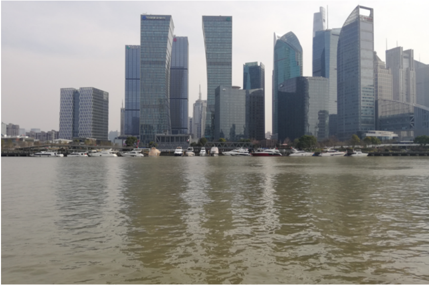
FIG. 7 One of the regular positioned marinas with decorative new yachts for rent along the new waterfronts of the Huangpu River. The yachts are rarely used.