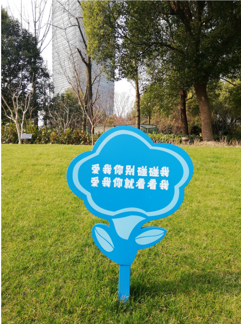
FIG. 12 Figure shows a sign with the text "If you love me, don't touch me!" to prevent people sitting on the grass lawns.

of the newly constructed West Bund became a very dynamic and attractive public space and also some parts of the North Bund and East Bund, although most of the waterfront still lacks users. The promised cultural facilities and historical linkages with the industrial past are established in multiple museums and galleries in reused and renovated warehouses, and the integration in the new landscape of cranes, rail tracks, anchor piles, and other artifacts. The low carbon promises are achieved through the replacement of industries and abundant green space for recreation, although the ecological connection is not optimal since there is no continuity for animals and plants in their natural settings. The new green spaces are mainly decorative grasslands and trees. Although parts of the embankments have a green character the waterfronts are still dominated by long stretches of concrete former industrial embankments and this seems unlikely to change soon. The promise to attract investment is also lacking, most new real estate projects (mainly offices and commercial spaces) are missing tenants. Tourism is limited to the Old Bund area and the new creative centers at the West Bund, which is less than 5% of the