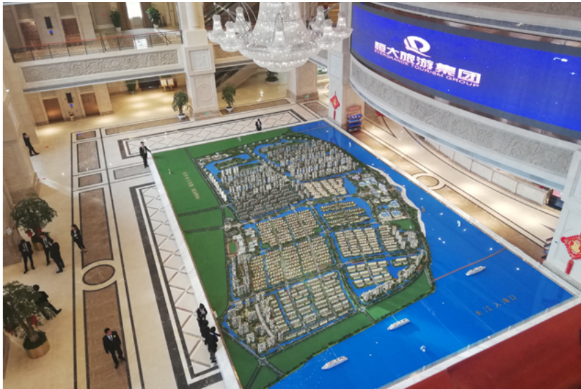
FIG. 16 Scale model of New Venice in Nantong (photo by author, 2018).