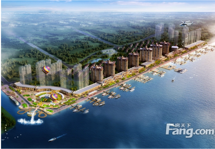
FIG. 13 Fragment of the Long Island development project.