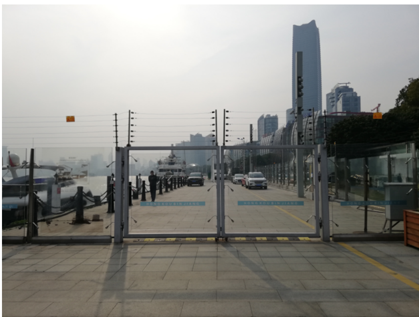
FIG. 11 Figure shows a partly privatized part used for docking luxurious yachts for rent, but seldom used.