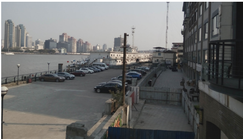
FIG. 6 The Cool Docks as depicted was shortly after its redevelopment in 2010 disconnected from the city by new floodwalls and parking, resulting in the closure of many restaurants in the old warehouses. Since 2018 this area is under redevelopment again (photo by author, 2018).