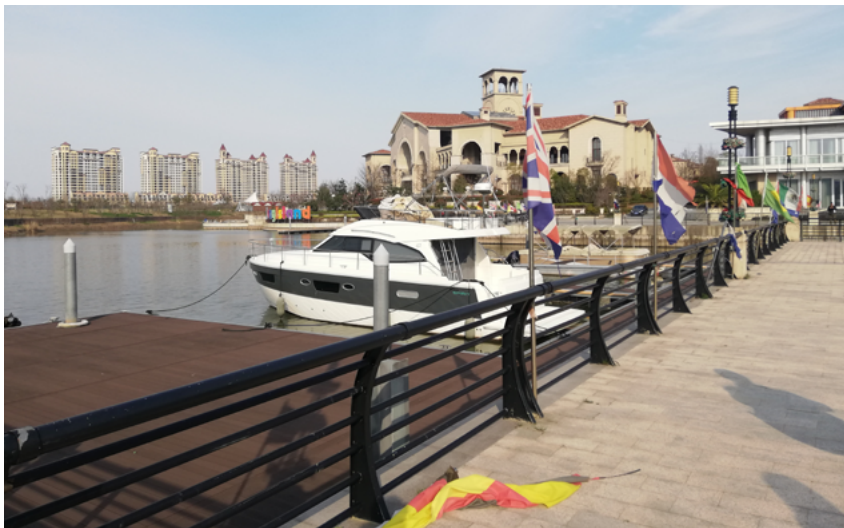
FIG. 15 Empty real estate for investment on Long Island. According to real estate agents and spoken residents almost 100% of the units are owned by Shanghainese.