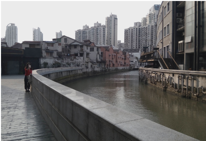
FIG. 5 Most creeks disappeared and the few remaining ones, such as Hongkou Creek, are often disconnected from urban life by floodwalls (photo by author, 2018).