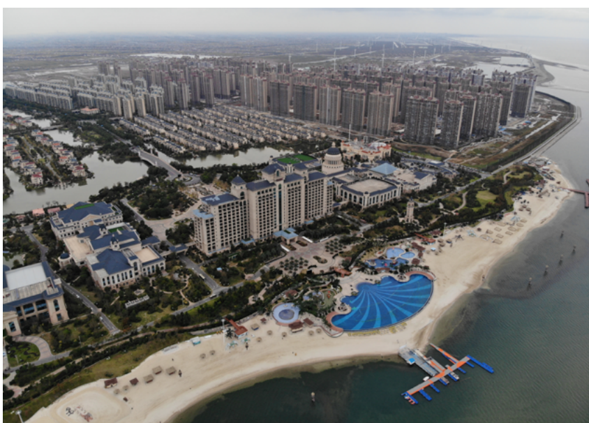
FIG. 18 Privatized new beach in New Venice, Nantong (drone photo by author, 2018).