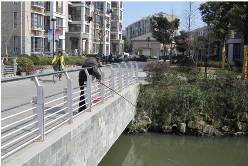
FIG. 20 Spontaneous use of watersides in new towns near Shanghai.