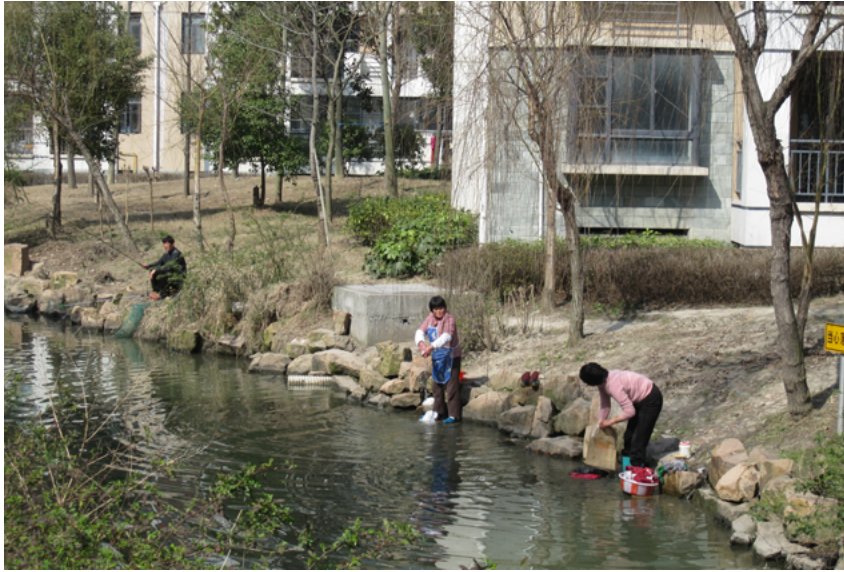
FIG. 19 Spontaneous use of watersides in new towns near Shanghai (photo by author, 2010 - 2019).