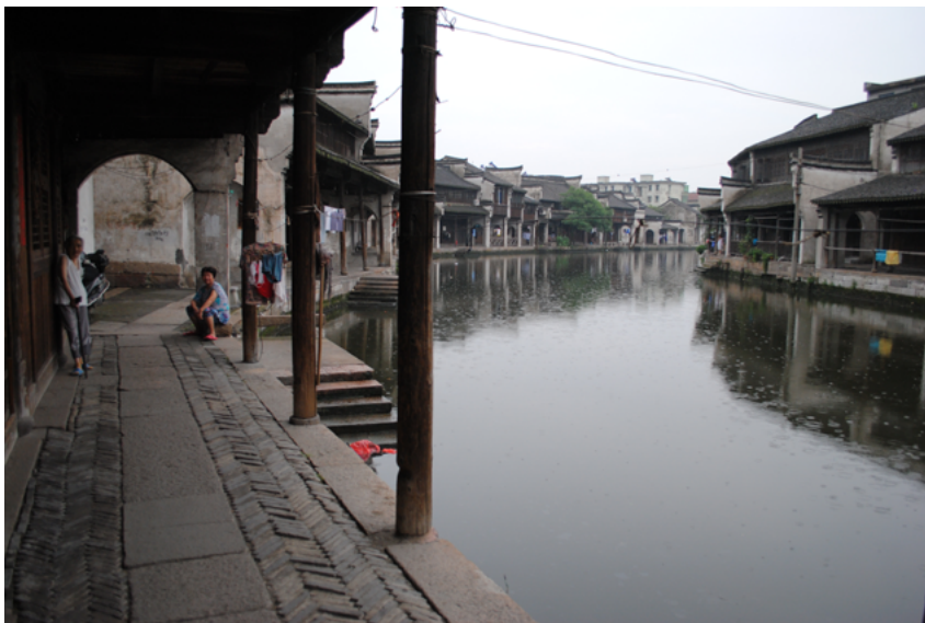
FIG. 2 There used to be a more direct interaction between urban life and water, also for washing laundry and cleaning food

Shanghai, and its wider urban region with neighboring cities and towns, used to be crisscrossed by waterways [Fig. 2]. The city’s name literally translates as “upon the sea,” since the coastline has been shifting eastwards due to sedimentation processes of the Yangtze River and tributaries. Water is not only a means of transportation and trade but also a source for stories, local myths and cultural practices. The classic Chinese painting Qingming Shanghetu , from the early 12th century, is the perfect